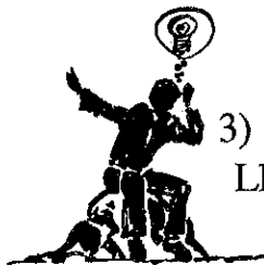
3) Repentance Lk. 15:17-19