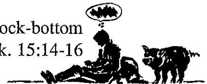
2) Rock-bottom Lk. 15:14-16