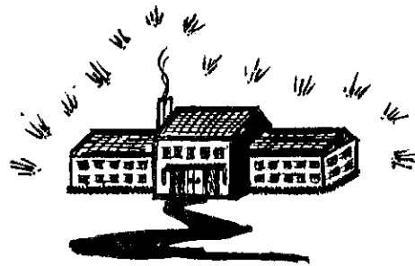
6) Reward Lk. 15:22-24