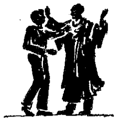
5) Reunion Lk. 15:20b-21